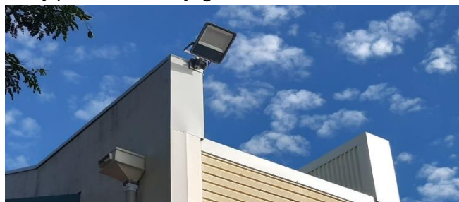
New LED Flood Lights Installed for the Lower Car Park

In observing the work that has been happening, we have now discovered that some repair work will need to be done to the skylights. A couple of the panels have cracks in them and the part of a panel in the northern skylight has broken away. You could say we felt like the apostles in the First Reading last Sunday, "staring into the sky", when we noticed these cracks and the broken away piece in the skylights.