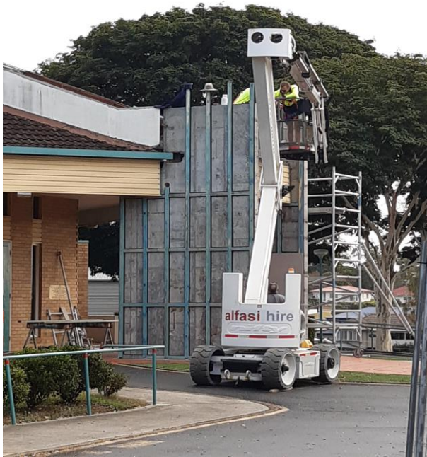
The entrance to the church on Thursday 7 May

This week the builders have started to work on recovering the concrete pillars at the entrance to the church. The first part of this has been rebattening the concrete pillars, which you can see from the below picture. The roofers are also continuing their work to repair the roof area at the four corners of the church.