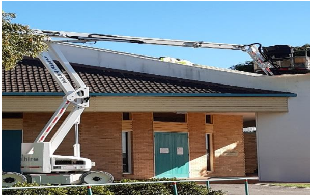
Inspecting the Church Roof on Monday 20 April

The first stage of work on the roof commenced this week. Following an initial inspection and work, asbestos has been found in parts of the areas that are being worked on. Therefore, removal of this asbestos should commence on Monday. If you are visiting the parish office, please adhere to any signage and fencing in place.